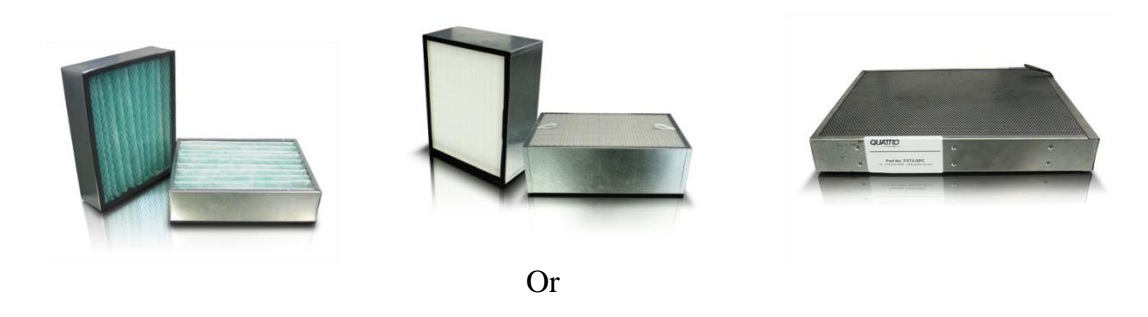
Standard 3D2 filter sequence when VOC's/odors are the main concern: