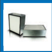
F075 HEPA Filter