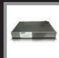
F072-GPC Chemical filter